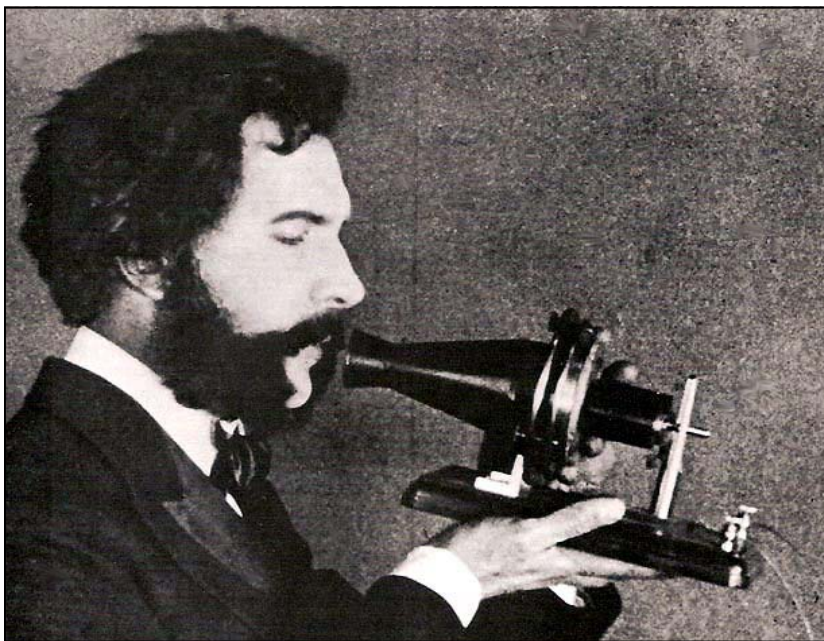
Written and compiled by David Gordon. Graphic design and layout by Chrystal Joseph

Bell soon had to admit that photophone was a flawed device. The frequent disruption of transmission caused by clouds limited its use. The full importance of Bell's work would therefore be recognized only many years later. It was only after the development of modern fiber optics that the secure transmission of light over great distances was finally possible. Bell's photophone was then recognized as the progenitor of the modern fiber optics technology that today transports over eight percent of the world's telecommunications. It is through devices such as this that Alexander Graham Bell, protean and prolific nineteenth century inventor, continues to contribute to technological progress and a steadily rising standard of living in the twenty-first century.