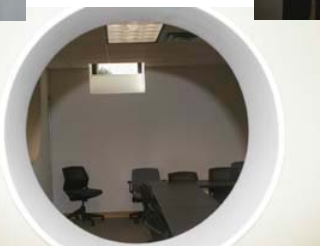
Portal in new CTE Center.