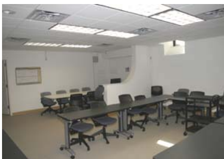
CTE Center, Philosophy Hall B02

Note: All workshops will be held in the CTE Center, lower-level Philosophy Hall. To reserve your place in a workshop, please call x5075 or x5951.