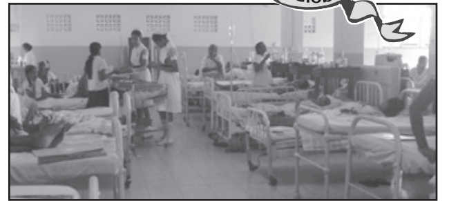
Sri Lanka to experience a hospital setting before attending university.