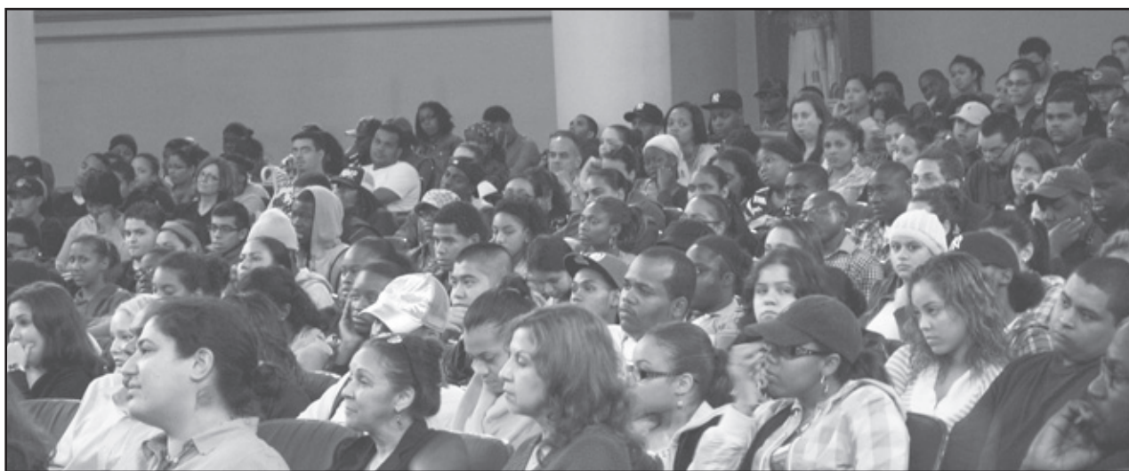
Freshmen at Fall Convocation in Gould Memorial Library Auditorium.