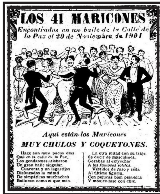
Hoja Suelta, José Guadalupe Posada, 1901